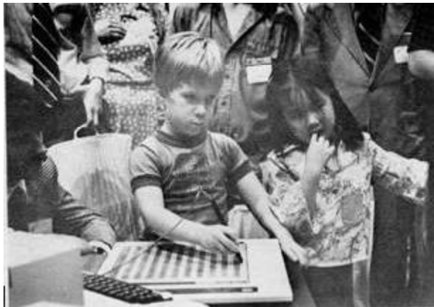
Figure 1. Kindergartner drawing into an Apple II, 1979 National Computer Conference.

Twenty-three years ago, when I put together the 1980 book, The Computer in the School , personal computers were just making their debut. Figure 1 shows a photo from the the book of a kindergartner in a vendor booth at the 1979 National Computer Conference in New York. He was using a just-debating digital stylus and tablet to draw directly into an attached Apple II and view the drawing on the screen as he made it. It was exciting—for him and for the many people watching.