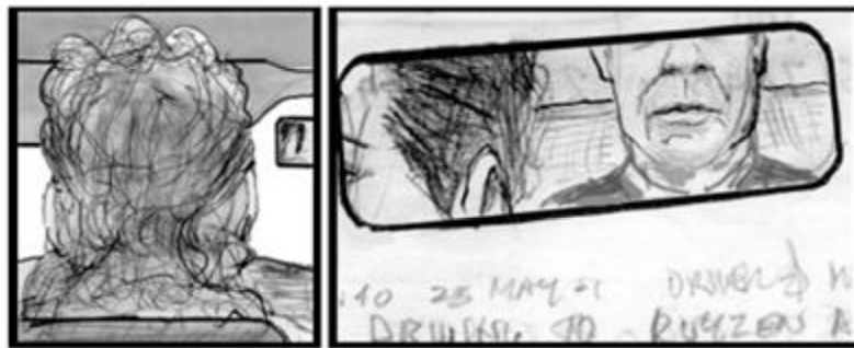
Figure 6. Self-portrait before a 4,000-mile flight.

The first illustrates the extreme casualness with which people undertake long distance travel today, travel heavily dependent upon digital technology, and suggests just how integrated that technology is on the one hand, and how reliable it is on the other. The portrait (left) and self-portrait (right) in Figure 6 were drawn in a taxi. The casualness with which they were drawn may seem understandable if they are viewed as done by someone who draws a lot and did it just to fill the time in another taxi ride. The casualness is astounding though when one considers carefully that the taxi-riding artist was bound for the airport in Prague, where he would catch a flight to New York that would cover more of the earth's surface in 7 hours than Columbus did in 5 weeks on his perilous first voyage from the Canary Islands to the Bahamas 500 years earlier.