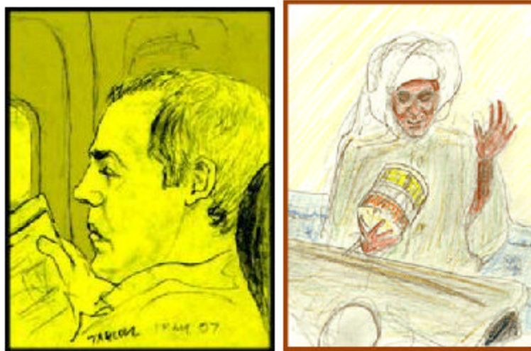
Figure 5. Global travel, traditional culture, and globalization—1999 (See Appendix B for additional context for these drawings.)

Because of increasing travel, instantaneous worldwide communication, and the increasing use of regional and global languages, the differences between local cultures must decline. This can create serious problems, as September 11, 2001, (the date of the terrorist attack on the World Trade Center) so clearly demonstrated. As a way of nurturing identity, humans have always cultivated subcultural differences, even to the extent of enslaving or killing those of another subculture.