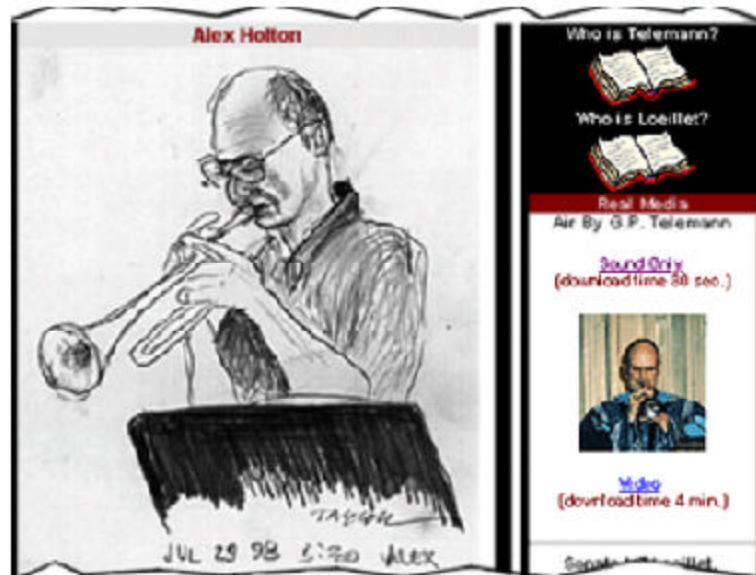
Figure 3. Accessing the multimedia riches of WebConcertHall.com

ideas, as they construct and refine projects realizable only through collaboration. For example, the seismology departments of several universities are connected digitally to a number of secondary schools distributed over a wide geographical area so students in each school can collect data from their school's own seismometer and then digitally transmit the data from all the schools into a pool accessible by the university scientists. They, in turn, analyze the pool of data and transmit their analysis back to the individual schools. Students, by actually participating in scientific work, can understand a concept (like the activity in the earth's crust) in ways and to a degree that would never have been possible before such digital collection and transmission became available.