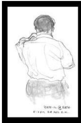
Figure 7. Drawing attached as jpg file to e-mail sent to Seoul

The communication example is this. One day while preparing this article, I received email at my office in New York from a pianist in Seoul, Korea, with whom I have performed in the past in New York, and in it she asked for a drawing I did of her violinist husband, playing at a concert a couple years ago. From my hard drive, I immediately retrieved a digital version (Figure 7) of the drawing and promptly emailed my response to her, inserting the digital version of that drawing as a file attached to the email, indicating the file's type. Then, confident she would receive it shortly and have no trouble opening and using it, I exited the email system and returned to some other work.