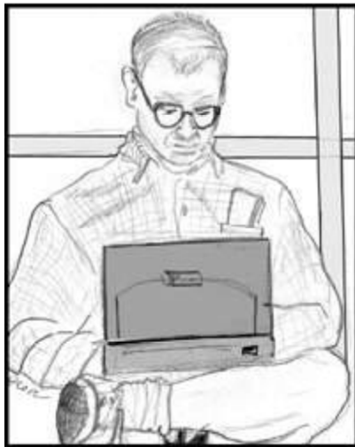
Figure 2. Digitally waiting in Amsterdam airport, 1997.

The world, in general, and the world of computers and digital technology in particular, have changed considerably since that day, as Figure 2 shows.